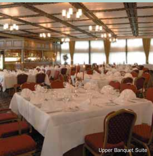
Upper Banquet Suite