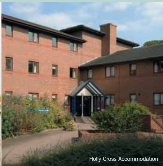
Holly Cross Accommodation